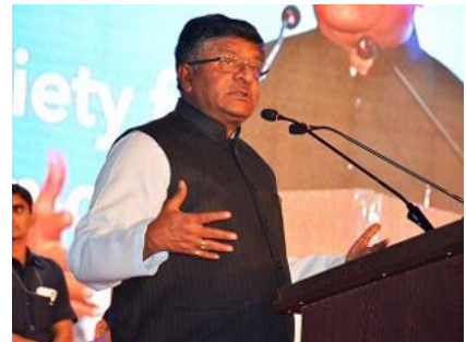
BSNL revenue increased by 2.32 per cent in 2014-15 to Rs 28,645 crore whereas MTNL witnessed an increase of 0.90 per cent to Rs 3,821 crore for the same period.

In reply to a query if the government has noticed that bogus certificate of caste have been used for securing employment in BSNL and MTNL, the Minister said "Yes."